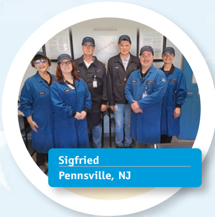
Sigfried Pennsville, NJ

SOCMA's government relations team engaged in face-to-face meetings at member facilities to better understand the challenges facing industry and provide regulatory insights on an individual company basis. We would like to thank our members for hosting us this year, giving us a chance to meet with them to discuss pertinent issues they are facing.