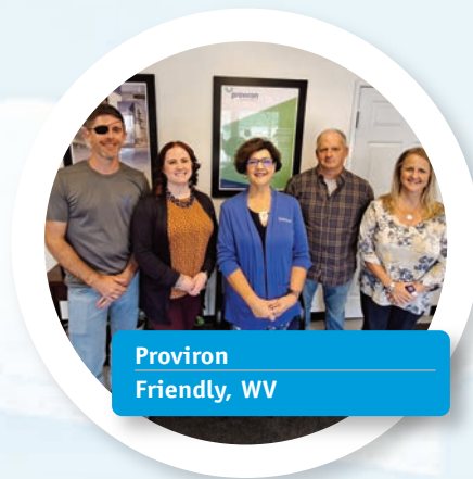
Proviron Friendly, WV