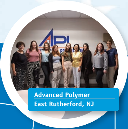
Advanced Polymer East Rutherford, NJ