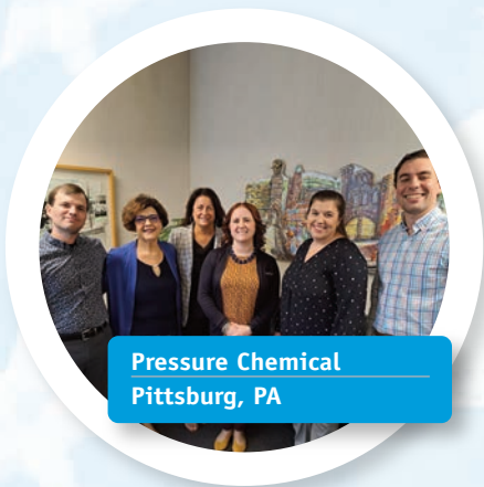
Pressure Chemical Pittsburg, PA