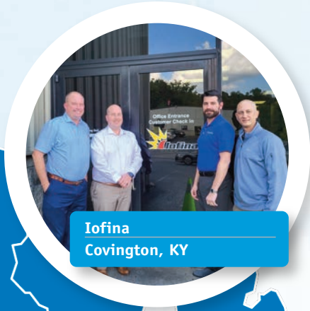
Iofina Covington, KY